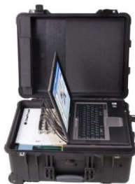
ONEPROD VMS transportable case 16 or 32 channels with BNC connectors (Available with different functionality levels and with or without PC)