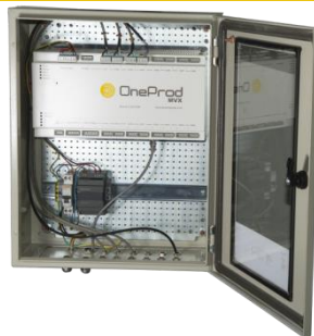
ONEPROD MVX Pre-equipped cabinet (solution on request)